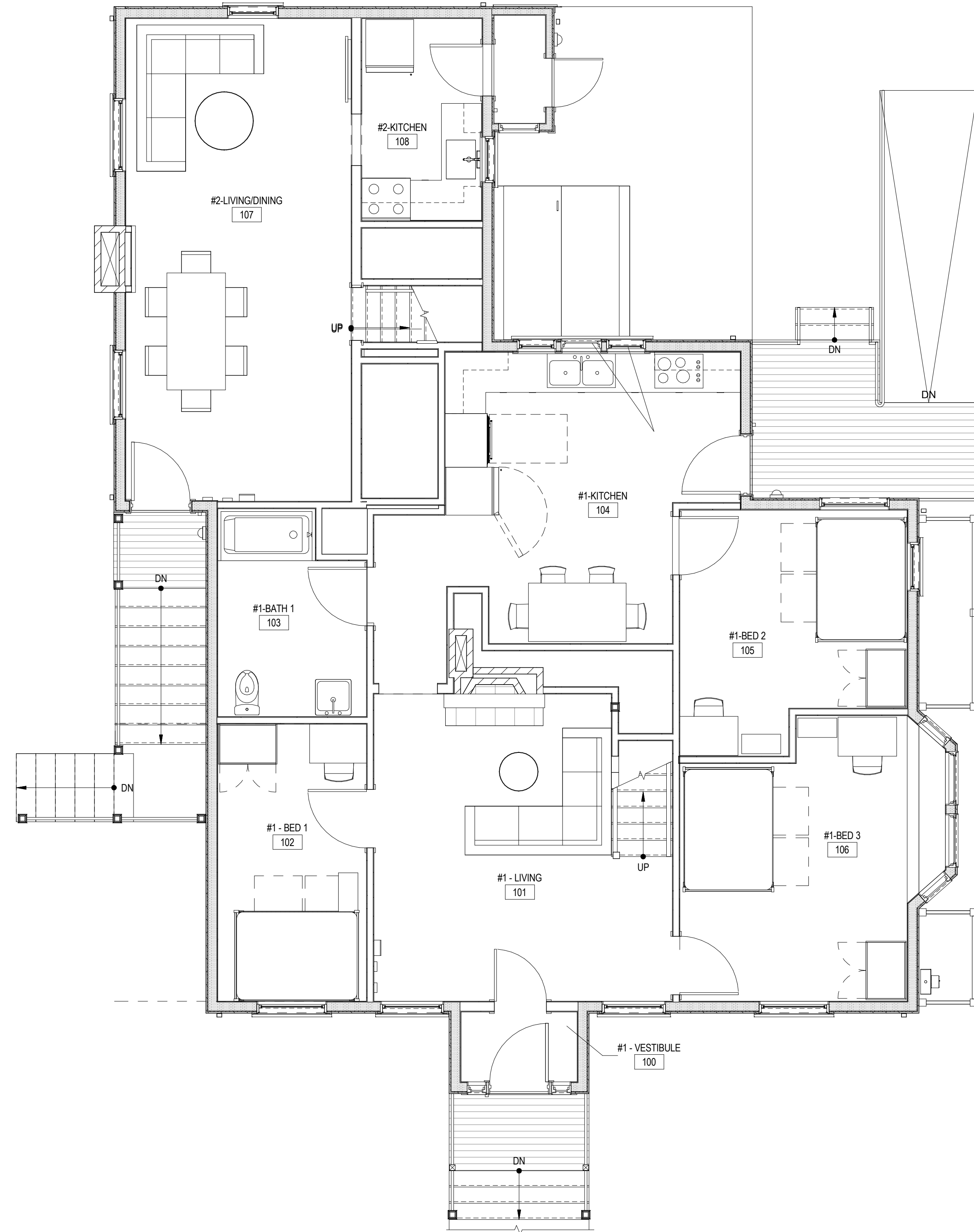
1 PROPOSED FIRST FLOOR PLAN SCALE: 1/4" = 1'-0"