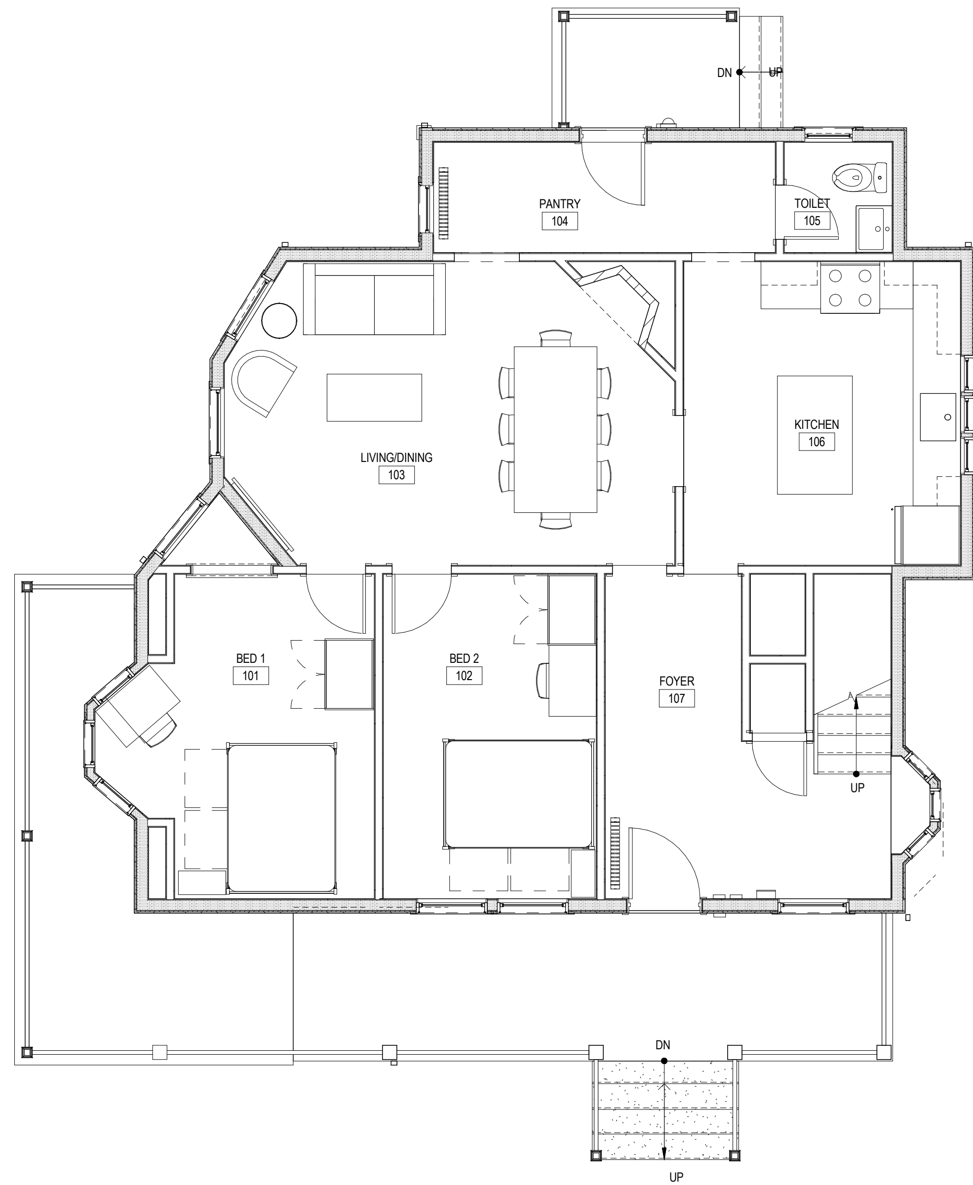
1 PROPOSED FIRST FLOOR PLAN SCALE: 1/4" = 1'-0"